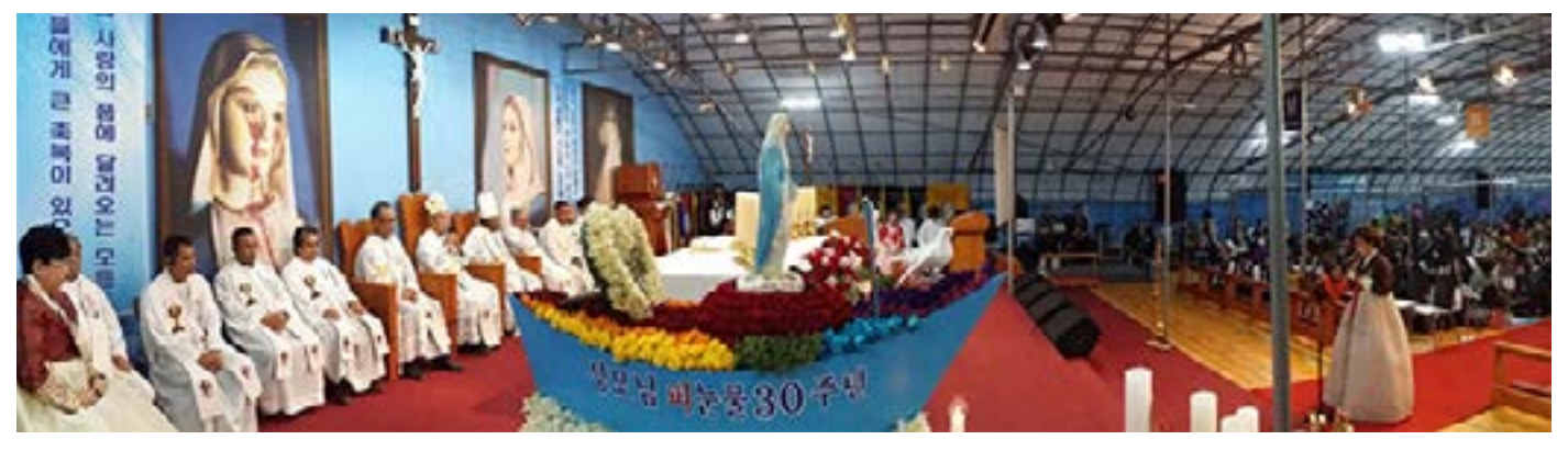
Offering up the Letter to the Blessed Mother of Naju