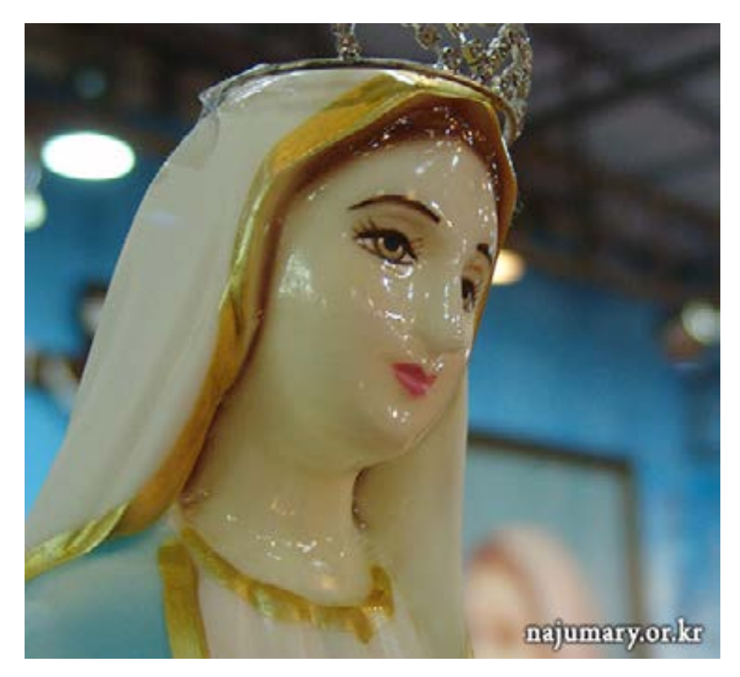
The statue of the Blessed Mother exuding Fragrant Oil profusely during entrance to the vinyl tented chapel