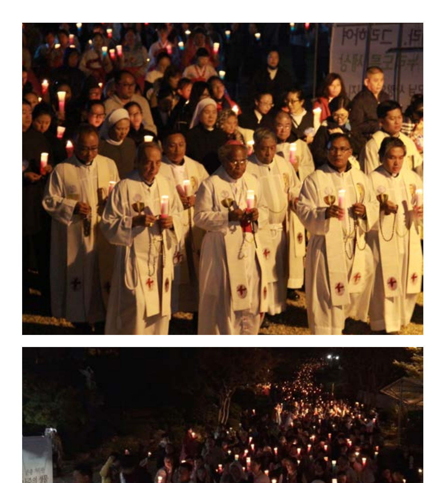
Both the clergy and pilgrims praying the rosary with lighted candles and walking on the Way of the Cross at the Blessed Mother's Mountain.