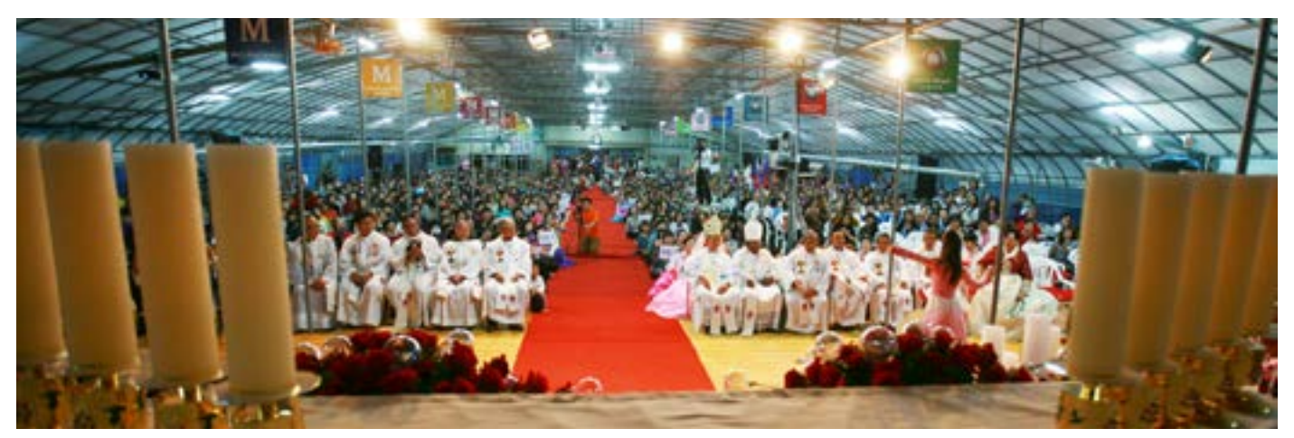
Offering up the dance to the Blessed Mother of Naju